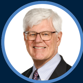
HON. JOHN P. MANLEY PC, O.C., F.ICD

"The ICD Annual Conference gives directors an opportunity to peek over the horizon at the issues and challenges coming down the track towards us."