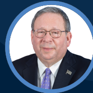
DAVID L. COHEN United States Ambassador to Canada

U.S. Ambassador David L. Cohen will speak to Canadian directors about the interconnected nature of our partnership, and what the future may hold for a continued positive and prosperous association.