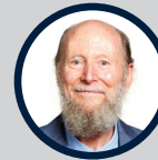
Dr. Richard Sutton FRS, FRSC Chief Scientific Advisor, Canada CIFAR AI Chair, Alberta Machine Intelligence Institute; Professor of Computing Science, University of Alberta