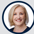
Hon. Lisa Raitt P.C Vice-Chair, Global Investment Banking, CIBC Capital Markets; Co-Chair, Coalition for a Better Future