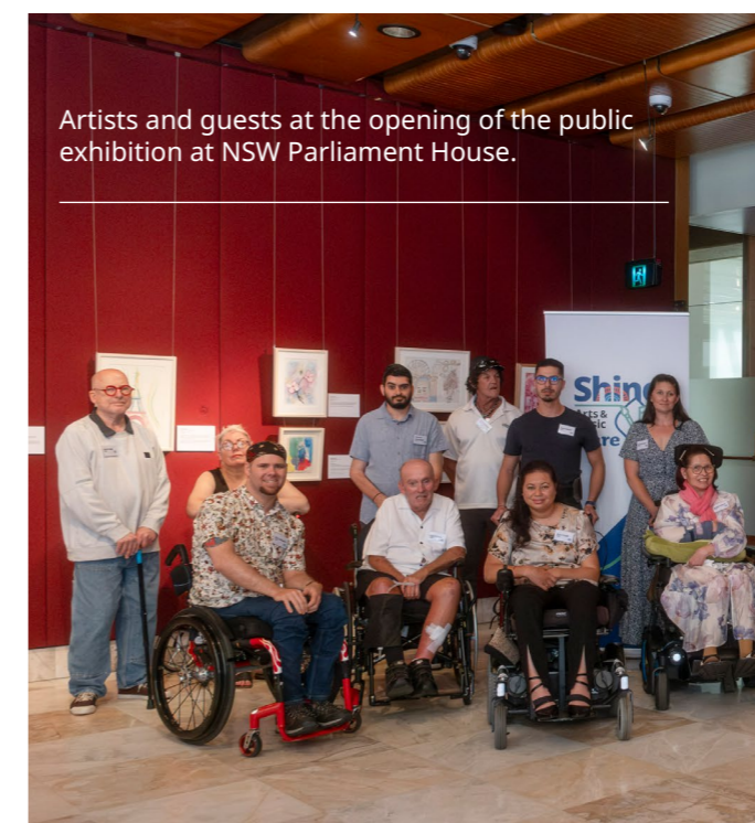
Artists and guests at the opening of the public exhibition at NSW Parliament House.