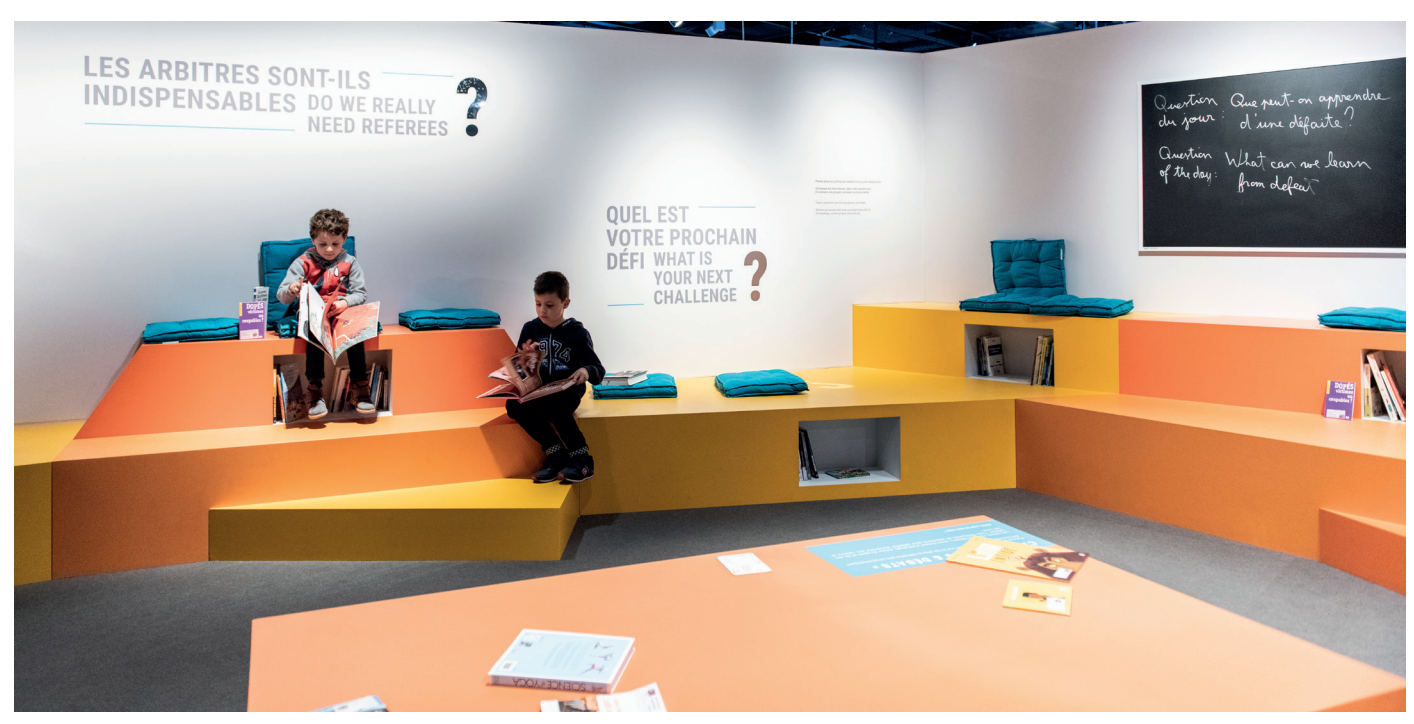
AND YOU? – PARTICIPATIVE AREA: Visitors can use the installations provided (books freely available to read, a game with cards) to think and talk about what they have seen and learnt.