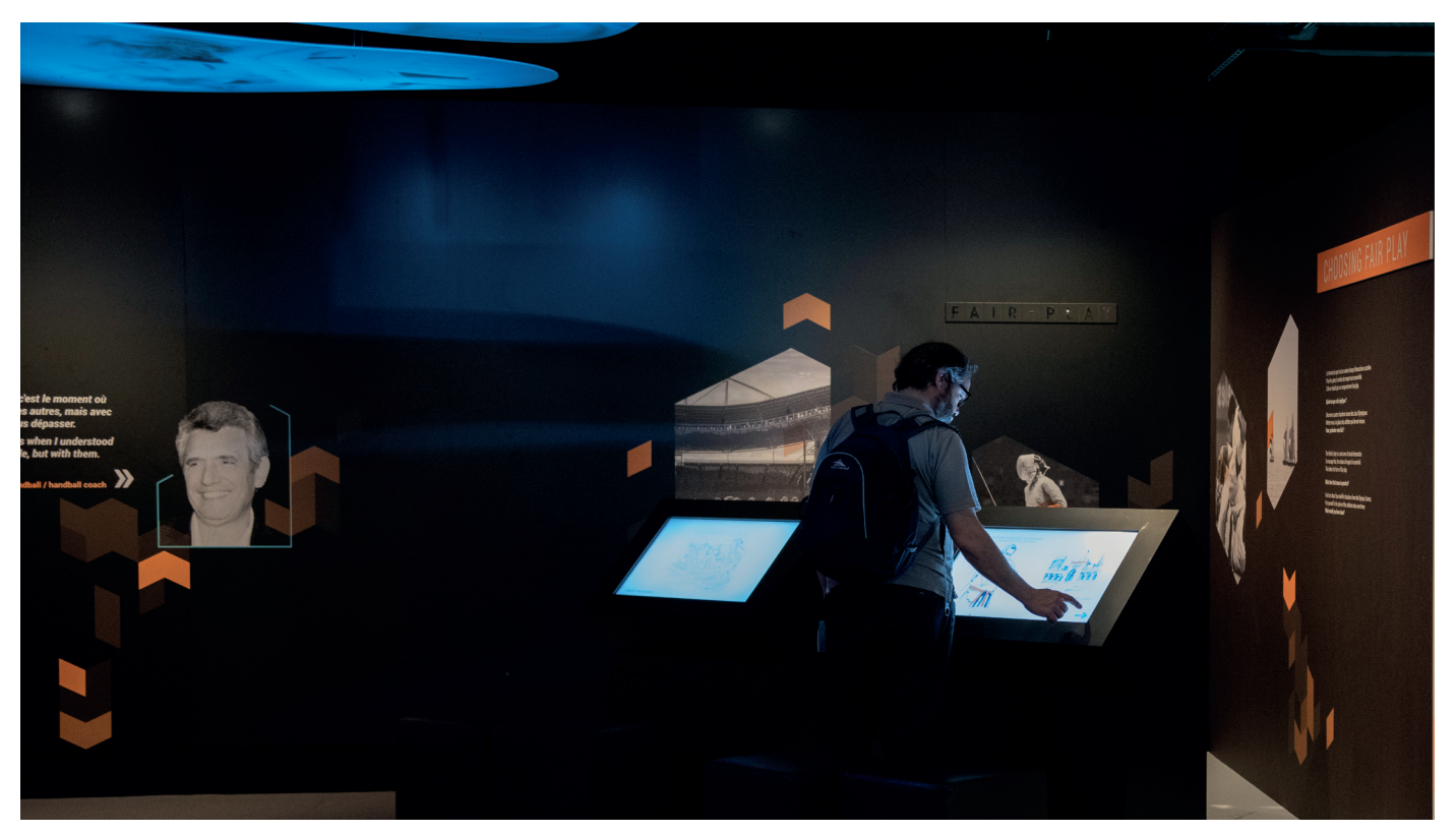
ME & YOU - CHOOSING FAIR PLAY:

Two touch-screen terminals with identical content - four interactive cartoons which put you in the situation of athletes who had to decide whether or not to choose fair play.