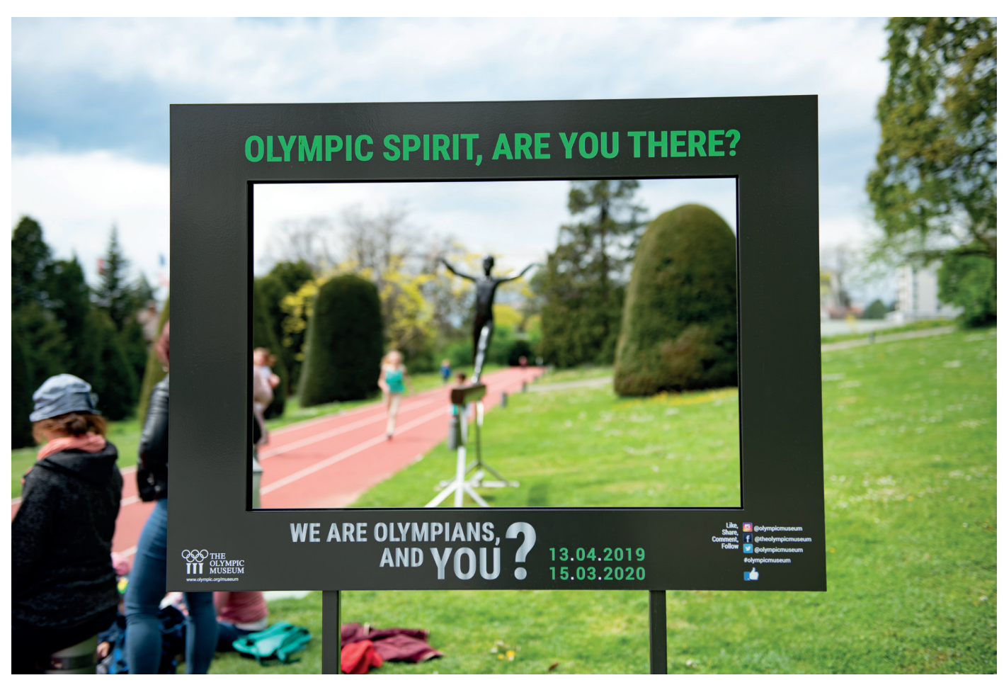
OUTDOOR INSTALLATION – visitors can get a taste of the exhibition theme before entering the Museum and share photos on social media.