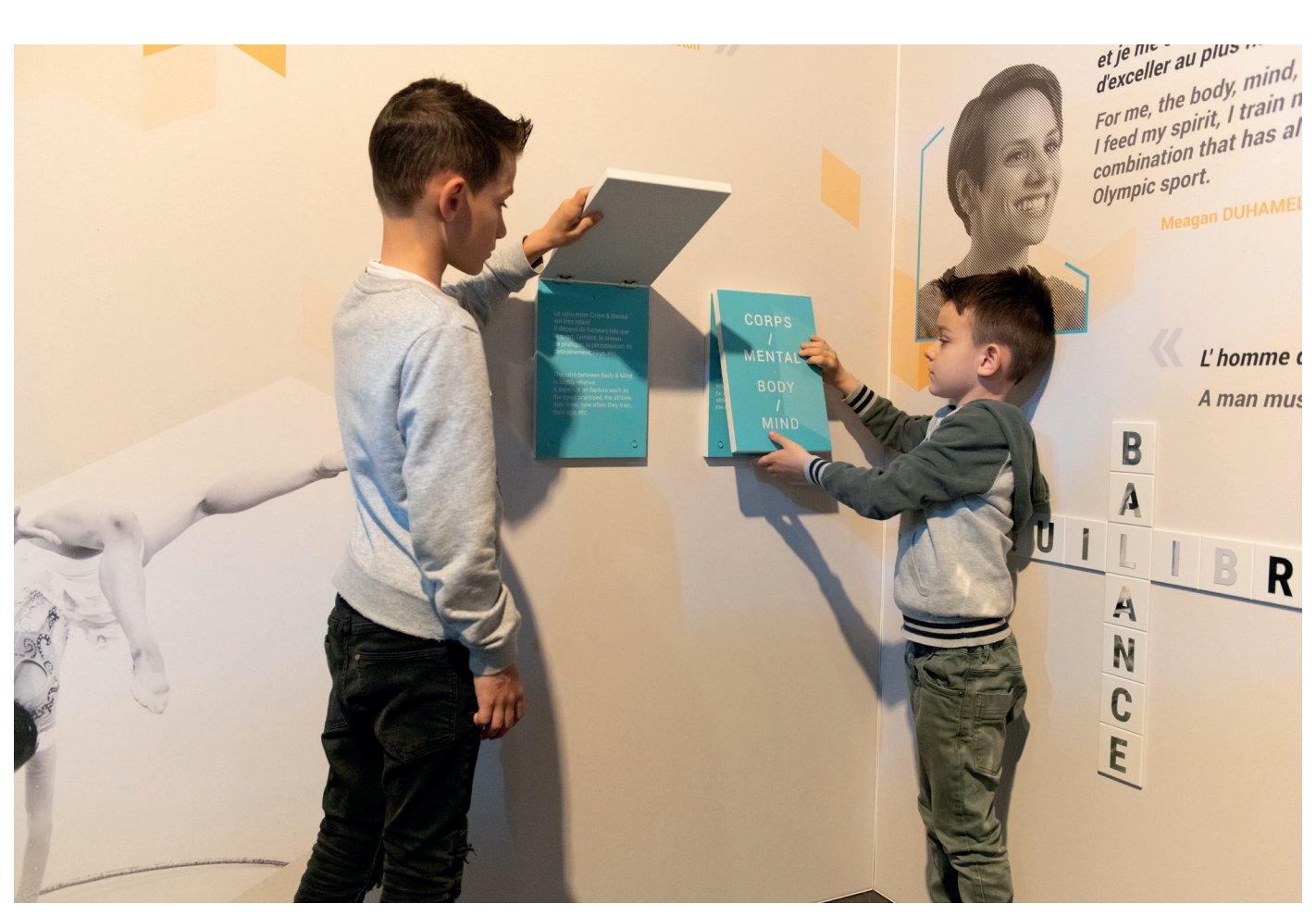
ME - MENS SANA IN CORPORE SANO: Two information panels with flaps that you can lift up to reveal the characteristics needed for a balanced body and mind.