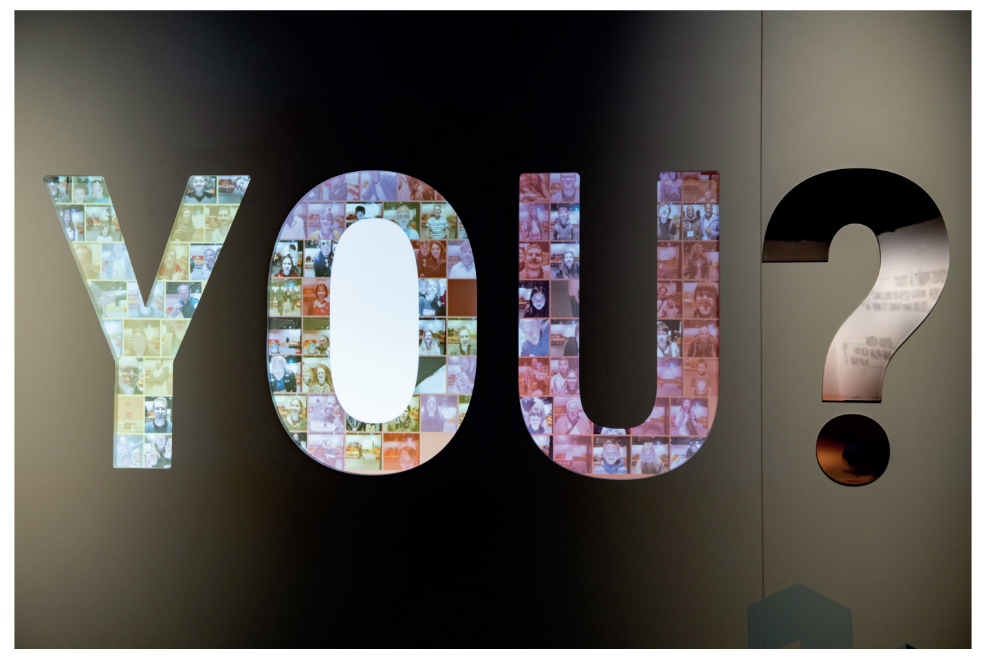
AND YOU? - A multimedia feature enables each person to choose a particular value and help to create a collective work.