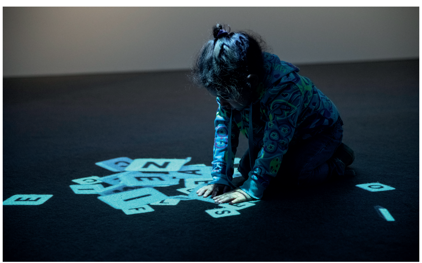
In a number of the exhibition areas you'll find an audiovisual floor projection with letters that, when rearranged, spell out key words.