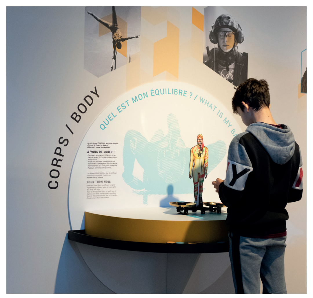
\label{eq:mension} \mbox{ME - MENS SANA IN CORPORE SANO: A balance game to help athletes put together a balanced training programme.}