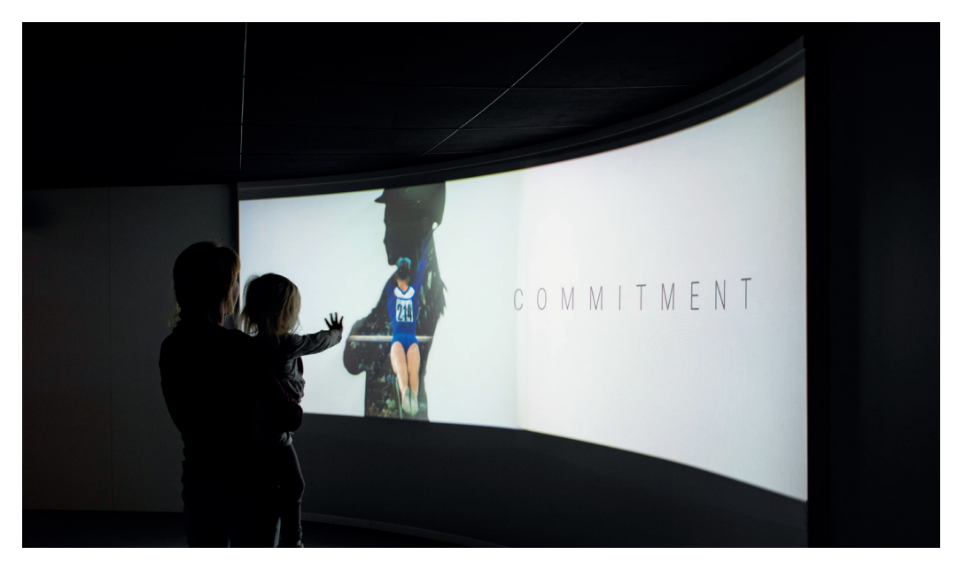
INTRODUCTION AREA – immersive experience in which sequences from the Games illustrating the Olympic values are shown on a screen, against a backdrop of athlete silhouettes. Key words are displayed alongside the clips.