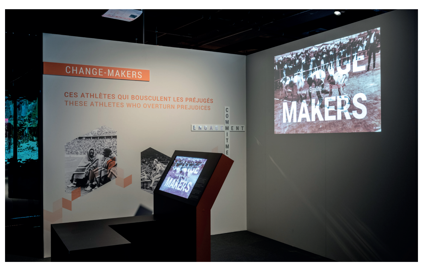
TOGETHER – CHANGE-MAKERS: An interactive feature with information on athletes who have made an impact in an area relating to equality or respect.