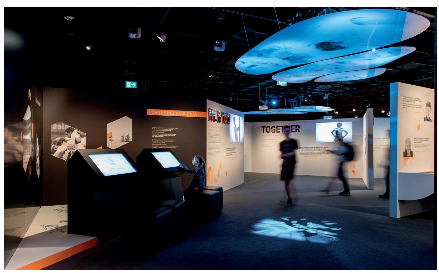
ME & YOU – CHOOSING FAIR PLAY: The area seen from another angle.