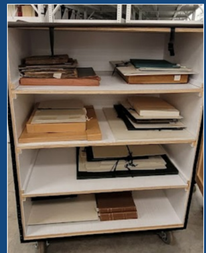
Custom carts used to transport special collections and archival materials. Carts are wide and able to be readily adjusted to adapt for handling unique materials for secure movement. Cart cover provides further insulation and protection.