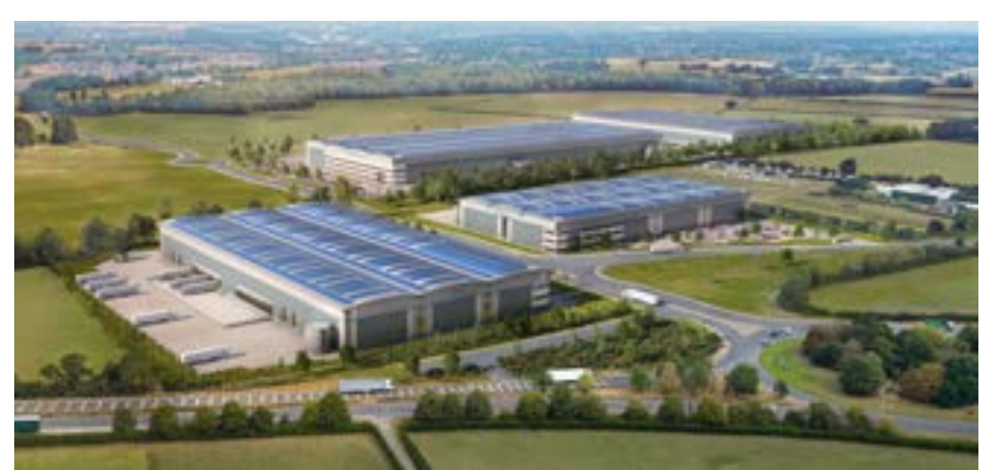
Learn more at: ironmountain.com/uk/services/warehousing-and-logistics