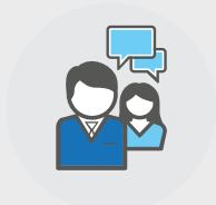
Initial client communications

COVID-19 has not only accelerated digital transformation in many financial services organisations but also changed how clients access information. Artificial intelligence and machine learning are a key part of that digitisation and help to automate processes. For the financial services organisations that do this, it means they are able to speed up many important projects, such as: