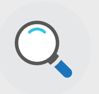
Financial background checking