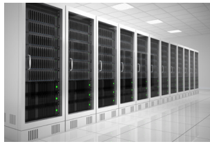
Single room data centers in co-location facilities