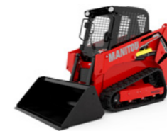
Medium Tracked Skid Steer

ATTACHMENTS: CLAW GRAPPLE, TRENCHER, FORKLIFT, ROAD BROOM, SOIL LEVEL ATTACHMENT, GRADER, BOX BLADE