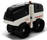
Articulated Padfoot Roller