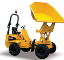
3T Swivel Tipping 4WD Dumper