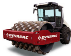
12T Padfoot Roller Single Drum