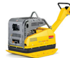
Reversible Plate Compactor 700kg