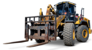
14.5T Front End Wheel Loader