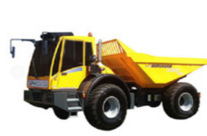
12T Swivel Tipping 4WD Dumper