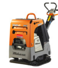
Reversible Plate Compactor 500kg