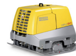
Remote Control Plate Compactor