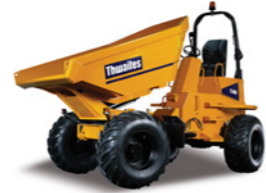
9T Swivel Tipping 4WD Dumper