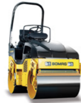
2.5T Roller Smooth Double Drum

For solid foundations and smooth finishes, we offer expert-grade compaction equipment hire. Whether you're working on driveways, trenches, landscaping, or road base preparation, our fleet of rollers helps you achieve reliable soil and surface stability for every project size.