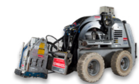
Diesel & 415v - Mini Loader