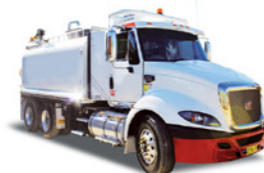
Truck - Water Tanker 15000L