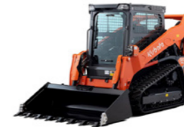
Large Tracked Skid Steer