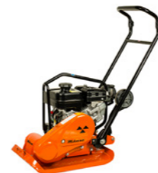
Plate Compactor 85kg