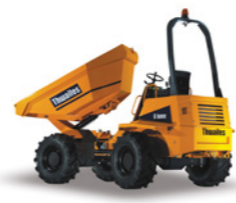
6T Swivel Tipping 4WD Dumper