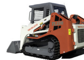
X-Large Tracked Skid Steer