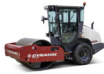
7T Roller Single Drum Smooth