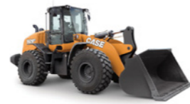
23T Front End Wheel Loader