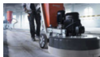
SURFACE PREPARATION & FINISH