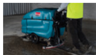
SWEEPING & SCRUBBING