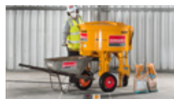
PUMPING, MIXING & SPRAYING