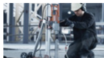
CUTTING, CORING & DRILLING