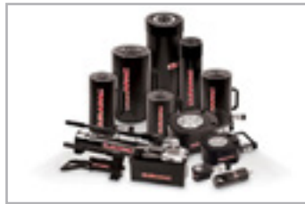
HYDRAULICS & JACKING EQUIPMENT