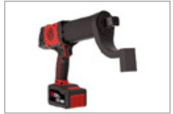
TORQUEING & BOLTING