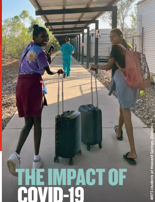
MITS students at Howard Springs, Darwin