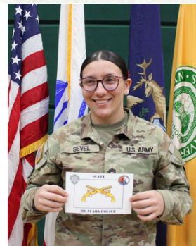
Sevel, Maggie Macedonia, OH Military police Army national guard Criminal justice & Psychology