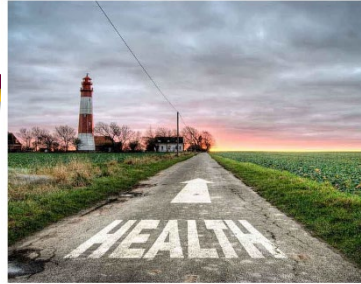
The Rural Health Group Iosco County, Michigan