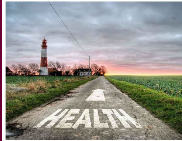
The Rural Health Group Iosco County, Michigan

Tapping community talents and resources for the greater good.