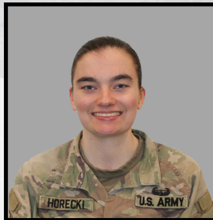
Battalion OPS SM