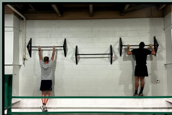
Repping out pull-ups to take the win for the event