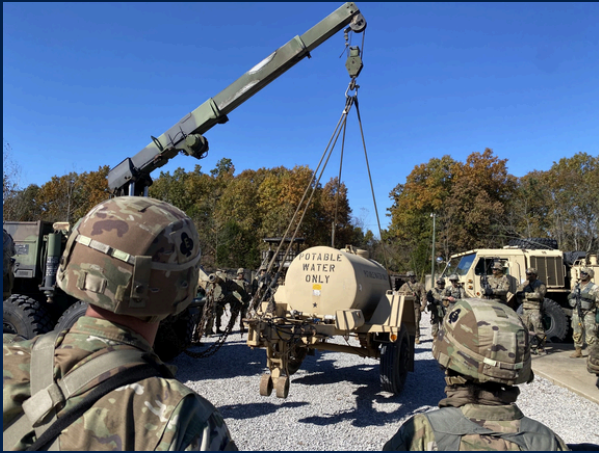
Sling load practice with E FSC in 2021