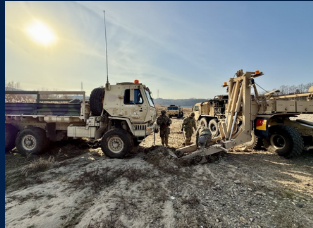
Dedicated Recovery Lane during PLT STX in 2024