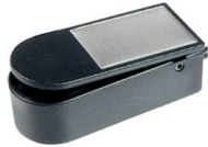
AbleNet Micro Light Switch