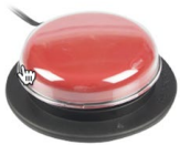
AbleNet Jelly Bean Switch