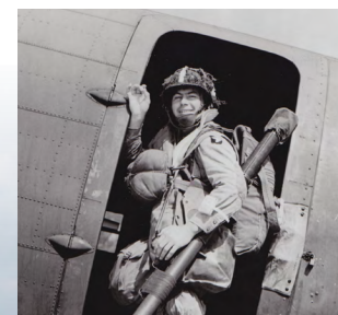
Paratrooper of the 101st Airborne Division prior to D-Day.