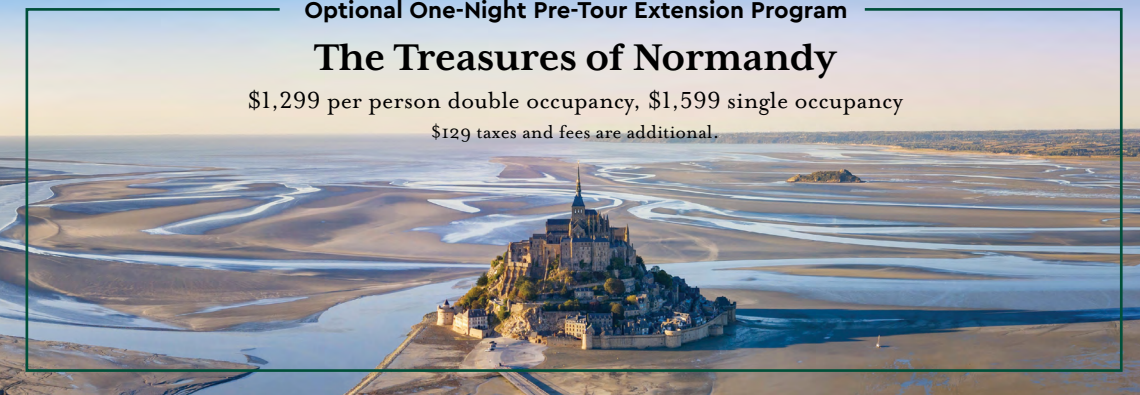
Aerial view of Mont Saint-Michel