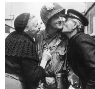
An American soldier is given a warm welcome after the town of Saint-Sauveur-Le-Vicomte was liberated.

Let us help you plan your journey into history by calling 1-877-813-3329 X 257.