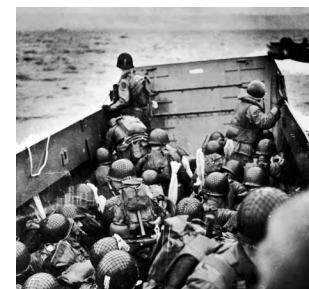
D-Day Landings on Omaha Beach