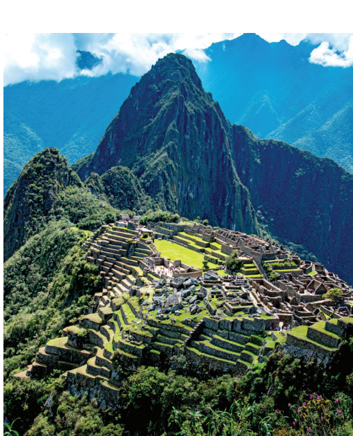
We explore the amazing ruins at Machu Picchu on Days 5 & 6.

Day 15: Quito/Depart for U.S. This morning we set out to explore Quito with its well-preserved historic center as we see on our city tour. Highlights include Plaza la Independencia and the 16 th -century Monastery of San Francisco. We then enjoy a tour of Quito’s Botanical Gardens featuring an orchidarium with more than 1,200 species of orchids; and a visit to Iñaquito Market, a colorful riot of fresh produce and spices. Then we return to our hotel for some leisure