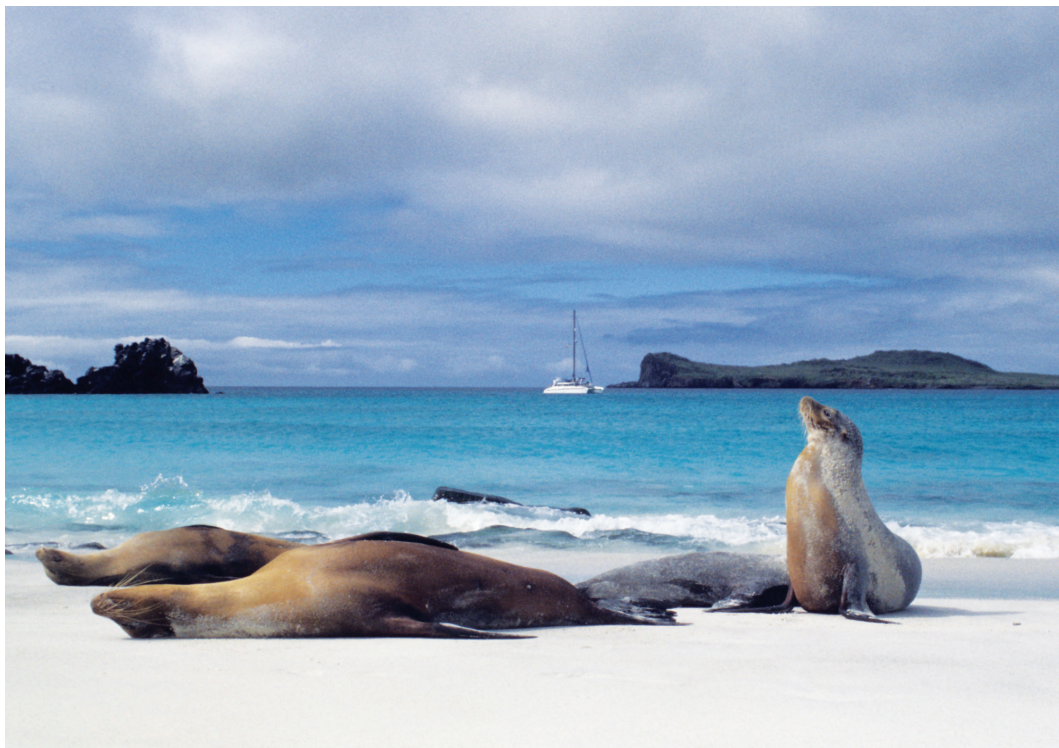
We encounter plenty of wildlife, like these sunbathing sea lions, in the Galapagos.

Day 8: Cuzco/Lima Today we return to Lima, arriving mid-afternoon. After some time to rest and refresh, we reconvene for dinner together this evening. B,D