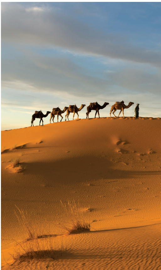
We ride camels in the Sahara on Day 8.