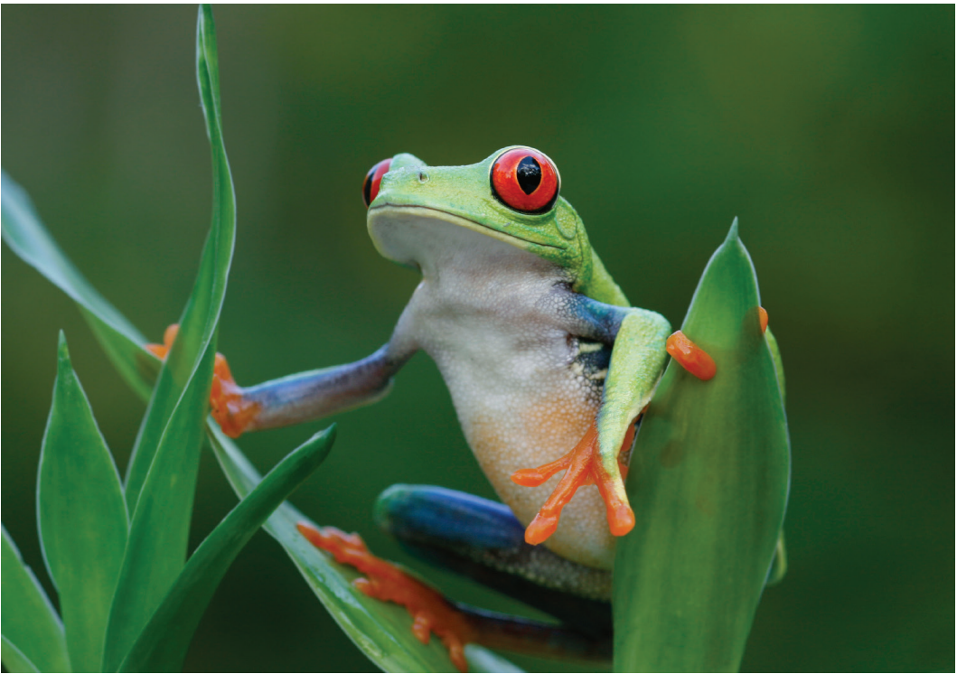
We see many colorful tree frogs in Costa Rica’s rainforests.

Day 5: Arenal Region On this morning’s visit to Arenal’s Mistico Park hanging bridges, we have the special opportunity to experience the rainforest from the canopy level as we traverse a series of five suspension bridges high above the forest floor. While we observe the rainforest from a unique perspective, our naturalist guide will point out some of the flora and fauna that thrive here. Then we return to our hotel, where the remainder of the day is at leisure to relax amidst the beautiful grounds. Lunch and dinner today are on our own. B