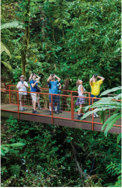
Arenal's hanging bridges

day at leisure along one of Costa Rica's most beautiful Pacific Coast settings. B,L