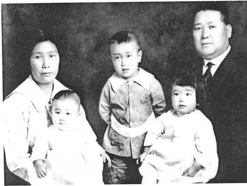
Asian American Family – circa 1920s

Asian American Studies Guest Lecturer Series presents