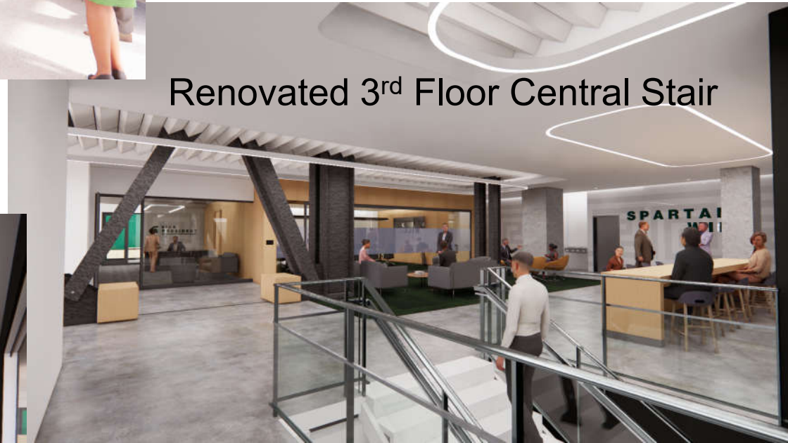
Renovated 3 rd Floor Central Stair