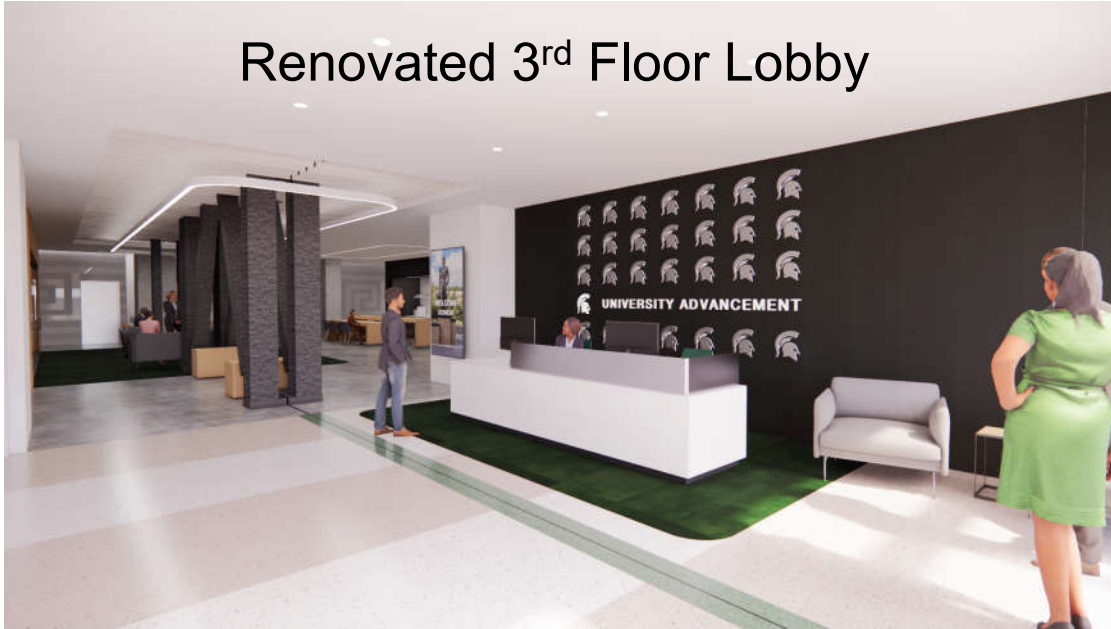
Renovated 3 rd Floor Lobby