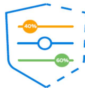
Calendar Year 2021 Performance

With NSW and Victoria ending their lockdowns, the ASX200 made modest gains across the quarter ending with the index up 1.6%. In the US, the S&P 500 performed strongly and jumped 10.7% thanks to continued strong earnings growth, across sectors such as Technology and Energy. The implied volatility of the ASX 200 fell slightly, ending the quarter at 10.6%, while in the US the VIX dropped 6 points to close at 17.2%.