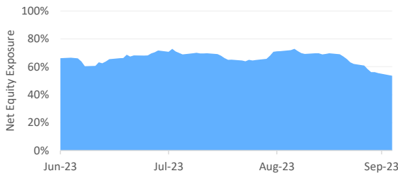
Dynamic allocation to equities

Uncertainty over how long central banks will keep rates elevated plus other ongoing concerns such as the Chinese Property market crisis lead to higher volatility/less stability in global markets through Q3-2023. As a result, SmartShield Growth portfolio has increased its hedge level, with the net equity exposure with the net equity exposure fluctuating between 73% and 55% (maximum equity exposure sits at 80%).