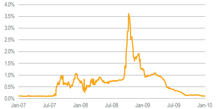
Figure 1: LIBOR-OIS Spread During the Global Financial Crisis

LIBOR’s risk component was apparent during the crisis when the spread between LIBOR and overnight indexed swap (OIS) 1 spiked as bank credit risk went up during the flight to quality.