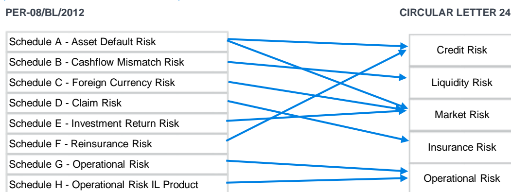
FIGURE A: MAPPING OF RBC COMPONENTS 1 OF CONVENTIONAL RISK UNDER NEW REGULATION (CIRCULAR LETTER SEOJK 2017 NO. 24)

Superseding PER-08/BL/2012, SEOJK No. 24/ SEOJK.05/2017 (Circular Letter 24) specifies the new Minimum Risk-based Capital (MRBC) to be calculated as the sum of the risk charges under five specified risk categories, which have been re-categorised compared to the previous regulations as summarised in Figure A below.