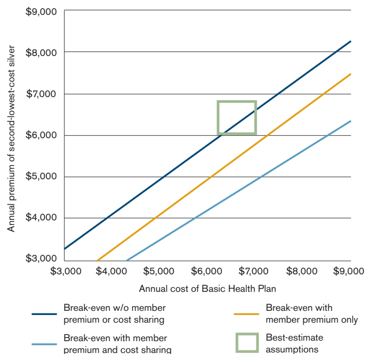
FIGURE 2: BREAK-EVEN ASSUMPTIONS FOR THE YEAR 2014