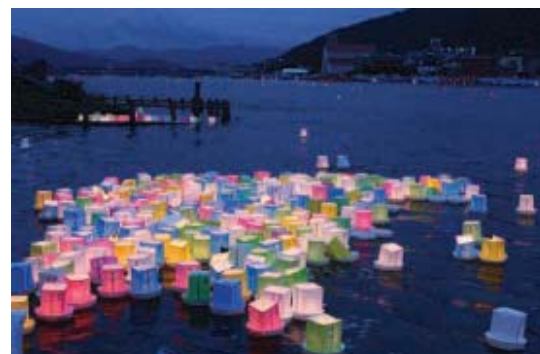
Survivors float lanterns on the Kitakami River for earthquake and tsunami victims.

Zenkyoren's residential earthquake exposure comes primarily from its building endowment policy. Unlike the annual fire insurance policies issued by private insurers, the building endowment policy covers insureds for five years or longer and automatically covers residential buildings and personal property from damages caused by fire, flood, earthquakes, and other disasters. Coverage also is provided if the policyholder or a family member is killed or injured in a natural disaster. In addition to covering losses caused by disasters, the building endowment policy may provide policyholders with a partial refund of premium that can be used to pay for essential home repairs, such as repairing