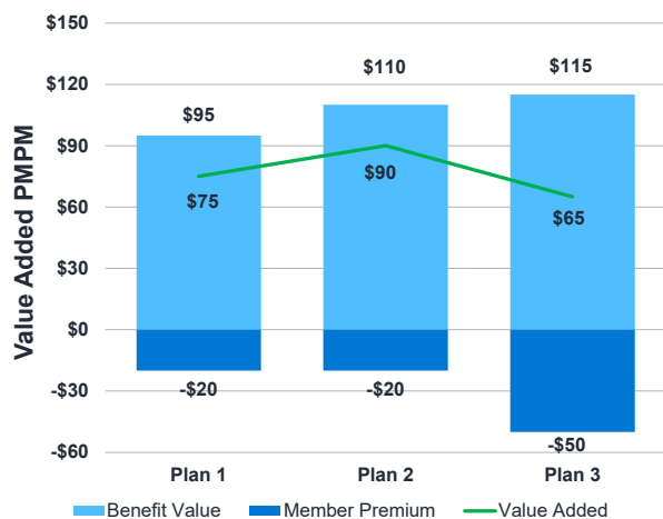
FIGURE 1: VALUE ADDED CALCULATION NON-DUAL PRICING BASIS

Milliman MACVAT produces results relative to the benchmark of traditional Medicare in a specific selected county, so the results are clear and easy to compare.