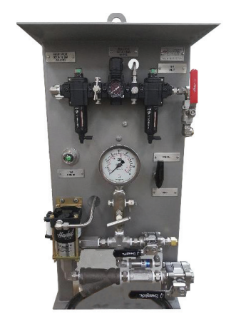
HPU and Valve Control Systems