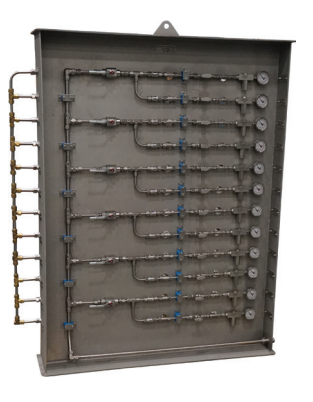
HPU and Valve Control Systems