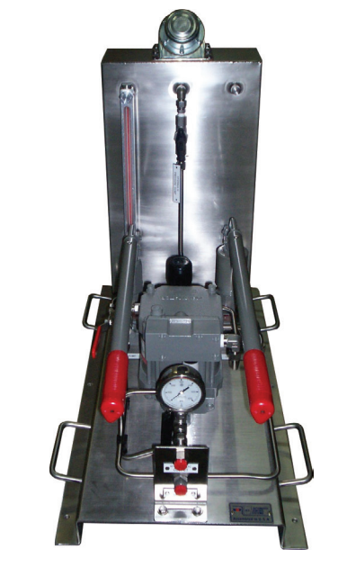
Portable Hand Pump Includes ¾ H.P. pneumatic driven hydraulic pump with accessories