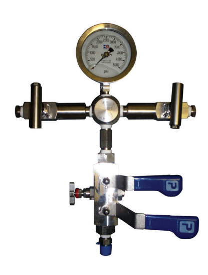
Double Block and Bleed Manifold Assemblies