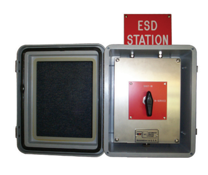
Available in manual or push button operation