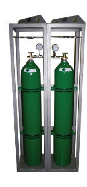
Bottle / Accumulator Racks

We support and offer a high level of aftermarket sales such as portable hand pumps, ESD stations, double block and bleed manifolds, accumulator/bottle racks, high-pressure valves, fittings, and tubing. Our range of accessories includes chart recorders, high-pressure hoses, relief valves, pressure gauges, and much more.