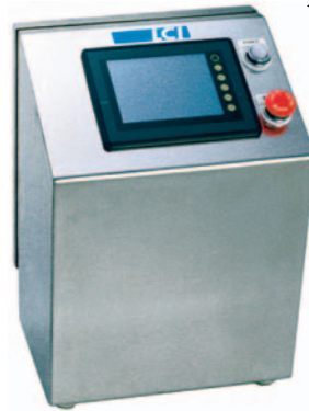
The LCI Batch Kneader is supplied with a touch screen control panel.

LCI Corporation is the exclusive distributor for Fuji Paudal Company, Ltd. in the Americas.