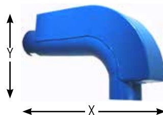
High Vacuum Reinforced Bend, 90°