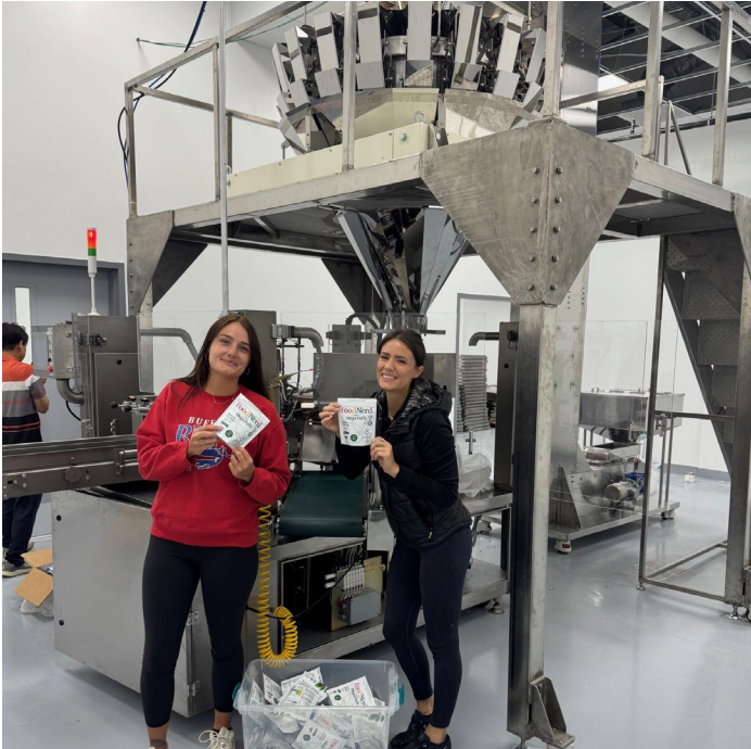
Food Nerd Inc. was awarded an Expansion Power allocation of 630 kilowatts at its Clarence, NY facility. The company has committed to retaining 6 jobs, creating up to 11 new positions, and $4.8 million in capital investments.