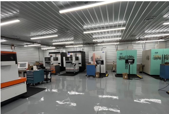
Fuller Tool Incorporated, a ReCharge New York customer, was awarded 60 kilowatts of low-cost power in exchange for commitments of retaining 8 jobs, creating 2 new jobs and spending $1.25M in capital spending.

In 2025, Authority staff conducted a cost savings analysis for RNY customers for the period of January 1, 2024, to December 31, 2024. It was determined that RNY Power allocations collectively provided program participants an estimated cost benefit of over $90 million. The estimated cost and benefits are based on a comparison of the cost of RNY Power versus the local electric utility standard tariff rates, reflecting estimated commodity and delivery costs.