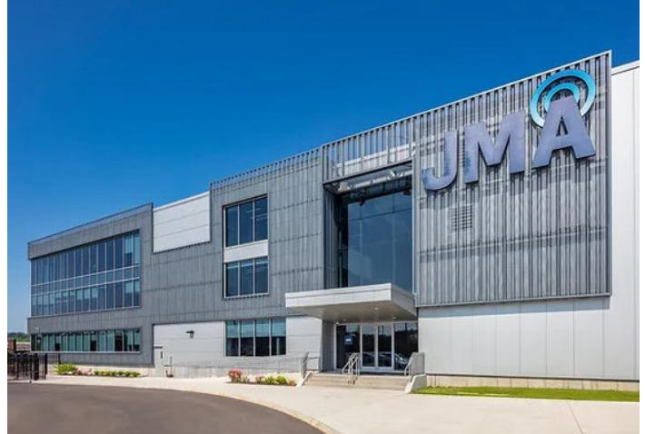
JMA Tech Properties, LLC was awarded 306 kilowatts of ReCharge New York Power for its Syracuse site in exchange for commitments of 100 new jobs and $25M in capital spending.

Pursuant to Chapter 60, the Authority was authorized, as of July 1, 2012, to “make available, contract with and sell” to eligible applicants such RNY Power allocations as are recommended by the Economic Development Power