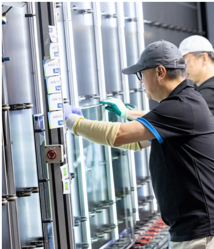
ReCharge New York customer Tempco Glass Fabrication LLC in Flushing, New York, was awarded 626 kilowatts of low-cost power in exchange for commitments of 67 jobs and $2.5 million in capital spending.

In 2025, Authority staff conducted an annual compliance review of customers receiving hydropower under the PP program, covering the reporting period of January 1, 2024 through December 31, 2024. The compliance review examined contract compliance in the Supplemental Commitment Areas.