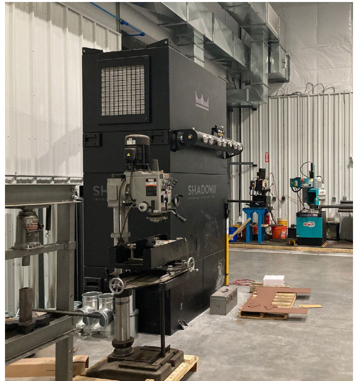
Solar Foundations USA, Inc. was awarded 140 kilowatts of low-cost ReCharge New York Power at its Clifton Park facility in exchange for 4 new jobs and a capital investment commitment of $4.8M.

The amount of power forfeited during the reporting year is approximately 13.2 MW. 6 This amount reflects customers who did not seek to extend the term of their power allocation, resulting in the allocation’s expiration or those customers who voluntarily left the program. This amount does not include reductions from compliance-related action, due to the jobs and/or capital investment adjustments mentioned above. This amount also does not include reductions in power in the allocation extension process due to the reduction of jobs and/or capital investment. It is not possible to identify precisely what portion of forfeited power was reallocated because, at any given time during the reporting year, there is some amount of unallocated power.