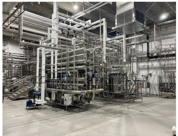
At its Franklinville facility, Great Lakes Cheese Co., Inc. received two awards for 6,616 kilowatts of low-cost ReCharge New York Power in exchange for commitments to retain 212 jobs, create 200 new jobs and spend $518M in capital investments.

As of the end of the 2025 calendar year, the EP and RP program was supporting a total of 35,213 jobs. 7