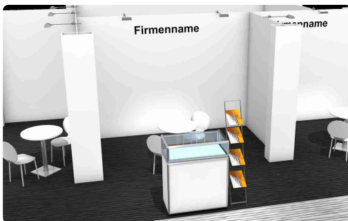
Exemplary representations, no legal claim.