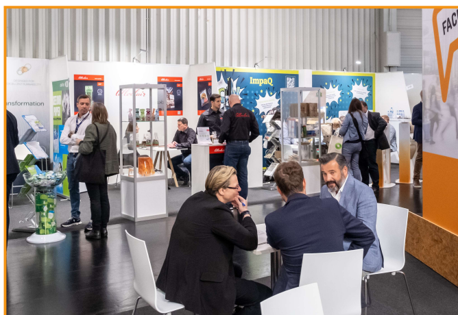
Exemplary representations, no legal claim.

BIOFACH also has special admission criteria also for non-food products and wants to ensure that the materials and production of packaging for the exhibited products are environmentally friendly. Please check whether your packaging solutions comply with these. You can find further information here: