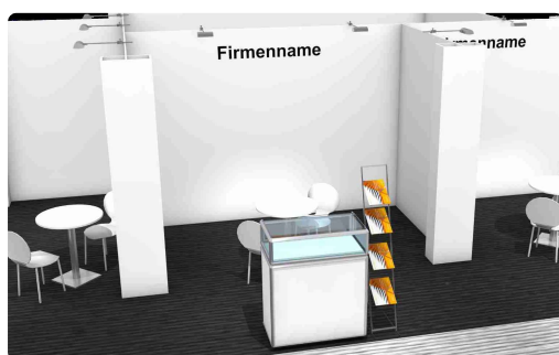
Exemplary representations, no legal claim.