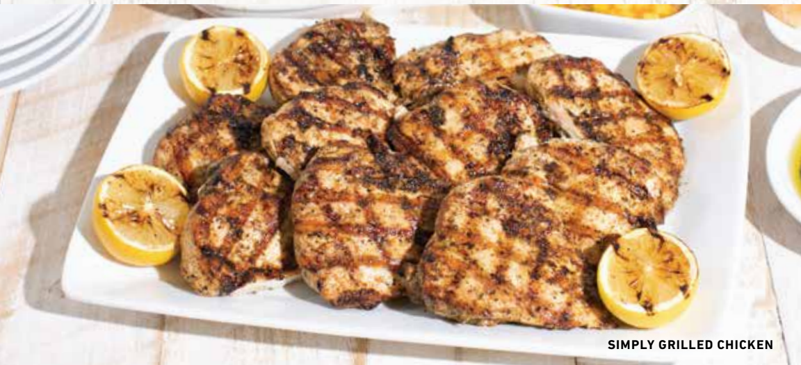
SIMPLY GRILLED CHICKEN