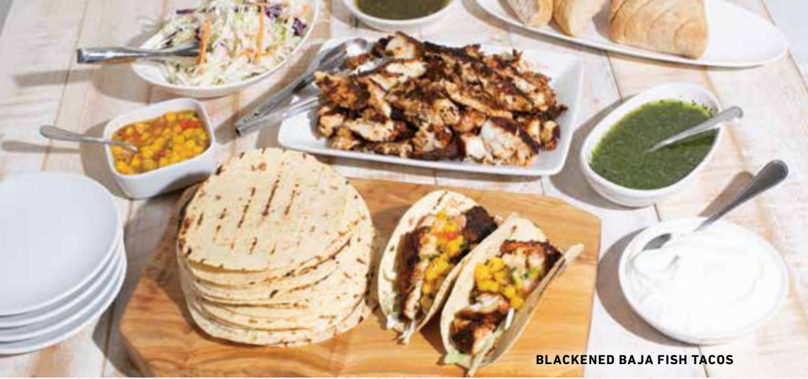
BLACKENED BAJA FISH TACOS