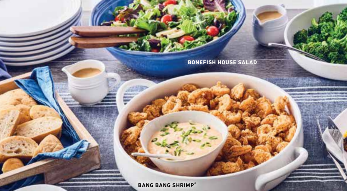
BONEFISH HOUSE SALAD