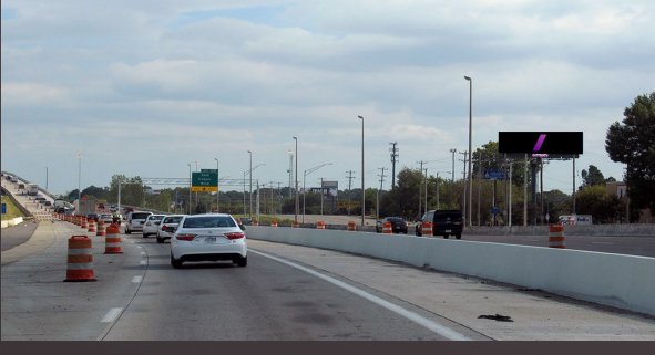
W/L I-40 1000 ft N/O Summer Ave Weekly Imps: 257,595