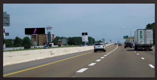
02-8358 N/L I-40 .2 mi W/O HWY. 64 / Weekly Imps: 93,720