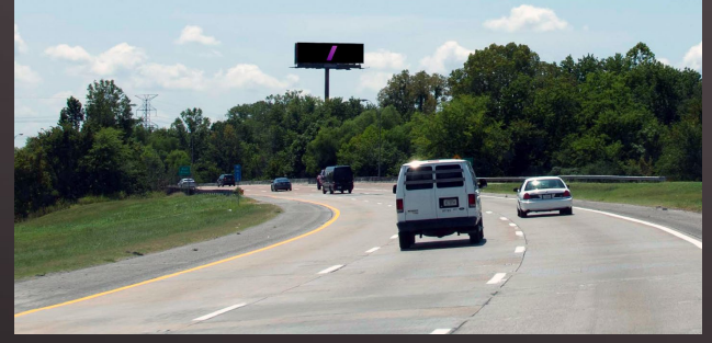
02-8353 W/L I-40 .6 mi W/O Watkins