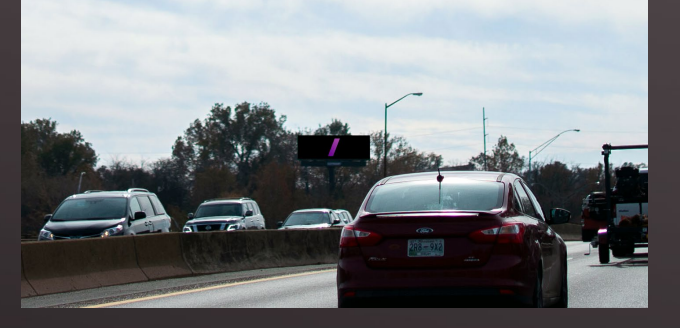
02-8366 E/L I-55 @OKLAHOMA ✓ Weekly Imps: 105,736