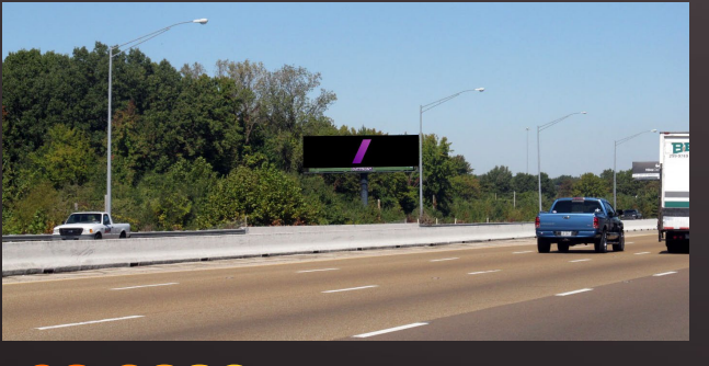
02-8228 WS I-55, 1500 ft S of Shelby Weekly Imps: 100,503