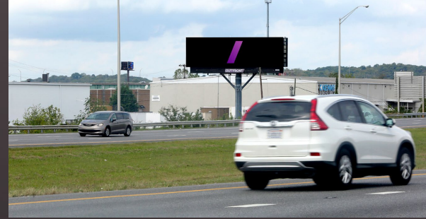
02-8725 I-24 I-65 W/S I-24 F/S / Weekly Imps: 179,260