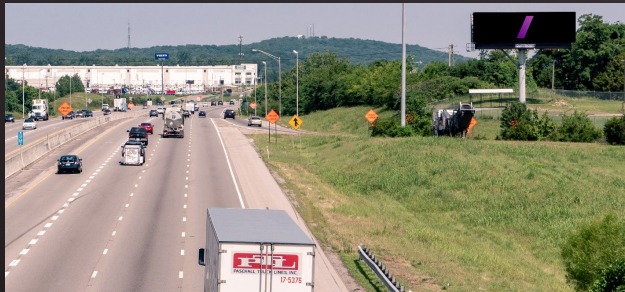
02-9036 N/L I-24 W/O Waldron Road F/E / Weekly Imps: 194,670