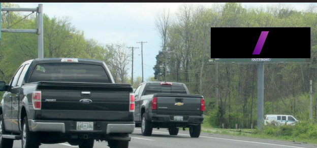
02-8773 W/L I-65 N/O Rivergate Pkwy F/N / Weekly Imps: 179,006