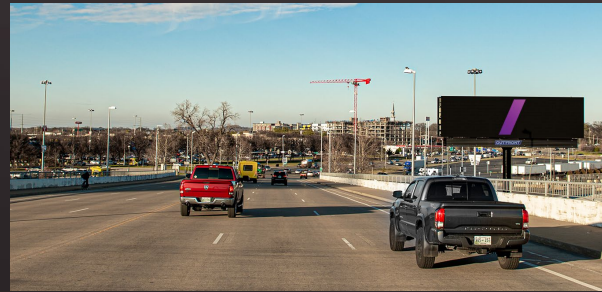
02-9119 E/L Korean Veterans Blvd. N/O S. 1st St. F/S / Weekly Imps: 89,420