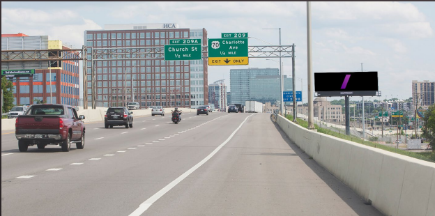
02-7105 I-40/I-65 Charlotte Avenue S/S F/W / Weekly Imps: 236,856