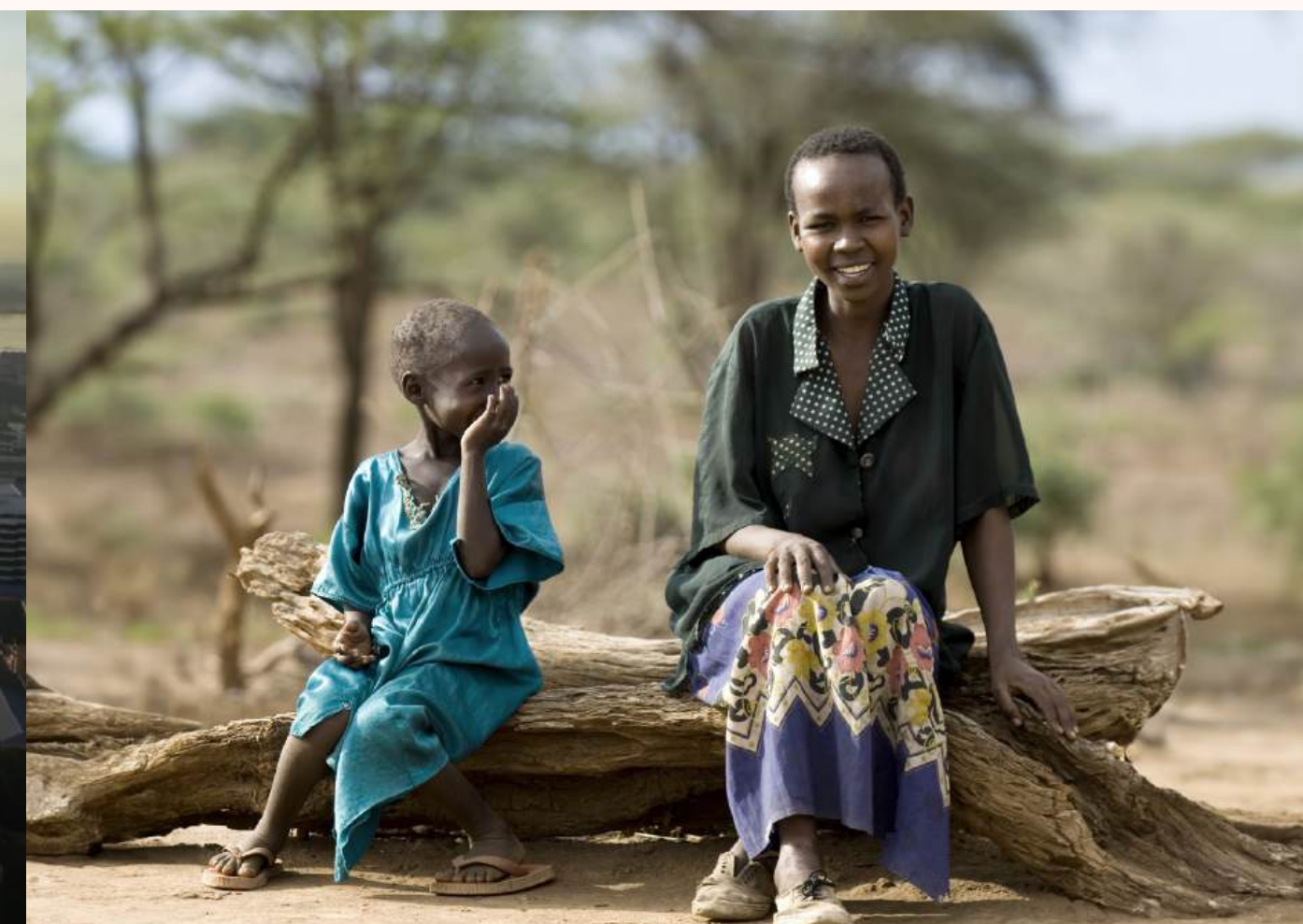
Stop Hunger Manifesto Video