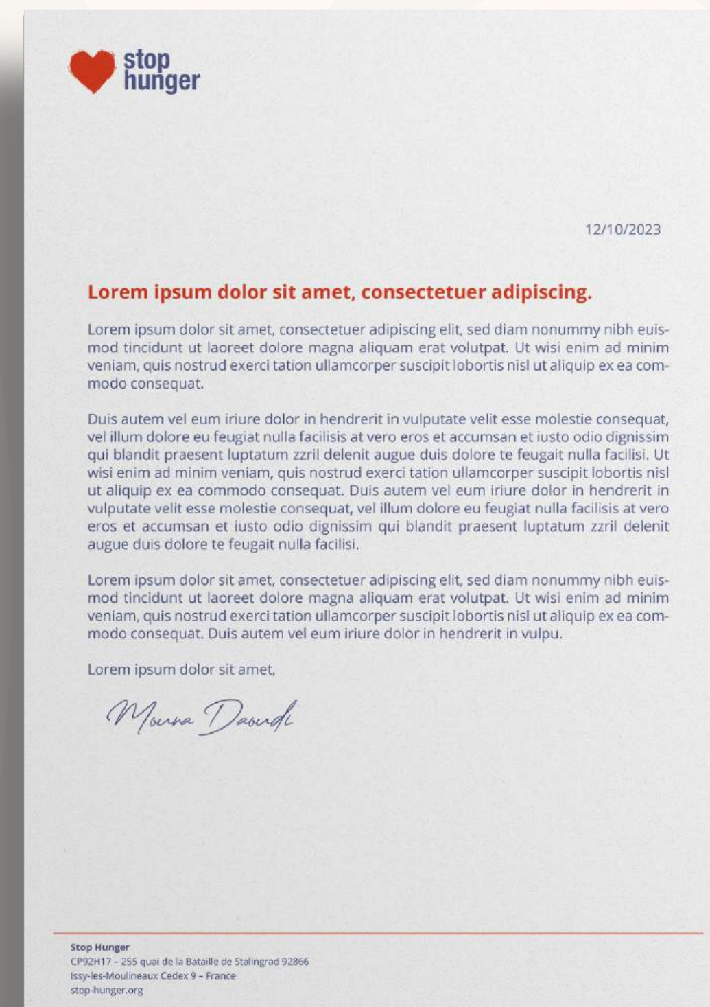
• Letterhead template

In our brand library, you will find an array of design assets and templates suitable for printing. As part of our impact on the environment, we encourage you to keep printed material to a minimum, using only recycled paper, but prioritize digital use when you can.