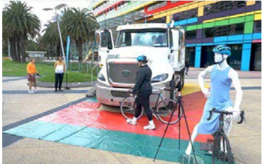
The Docklands Swapping Seats activation invited community members to sit in the driver's seat of a construction truck and experience its blind spots first-hand.

We invite you to share our safety messages with your local communities and network. If you would like to receive a campaign stakeholder pack with shareable content and creative assets, please get in touch.