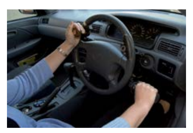
Examples of hand operated brake with 'over-ring' and 'thumb operated' accelerator and hand operated brake/ accelerator with steering aid.