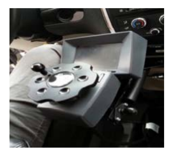
Example of alternative steering system