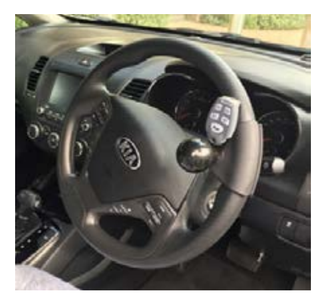
Steering aid with integrated secondary controls

Safe vehicle control including steering control is the primary concern. The client should demonstrate full range of movement of the steering wheel when only using one upper limb. Adaptive equipment such as an indicator extension or integration of frequently used secondary vehicle controls into a steering aid/device (e.g. indicators, horn) may be required.