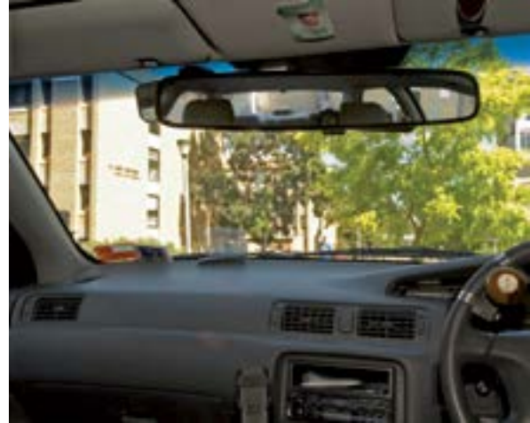
Over sized mirror

Drivers who require non-standard vehicle controls must demonstrate in an on-road driving test that they can safely and consistently drive a vehicle fitted with such devices before VicRoads will permit them to obtain or retain a driver licence. If the driver is successful, the licence will have a condition placed on it and it is then a legal requirement for the driver to only drive a vehicle with the relevant modifications.