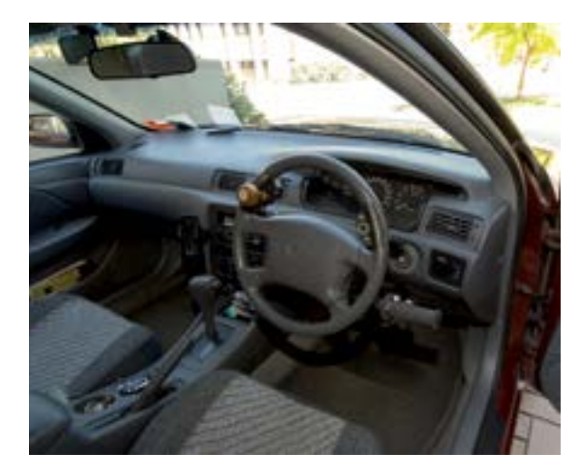
Hand controls with steering aid

Some examples include 'spinner' or steering aids applied to the steering wheel, left foot accelerator pedals (pedal repositioned on the left side of the driver foot compartment), hand controls (as an alternative to foot controls if a driver can't use or doesn't have lower limbs) and special/additional mirrors. Some driving aids or modifications can only be fitted in a vehicle with automatic transmission.