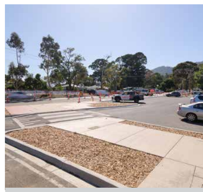
New angle parking and a raised pedestrian crossing at the Mount Dandenong Tourist Road shopping strip.