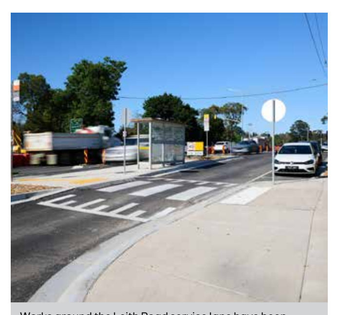
Works around the Leith Road service lane have been completed, including fresh parking for the Leith Road shops, new decorative concreting, a raised pedestrian crossing and a new bus stop.