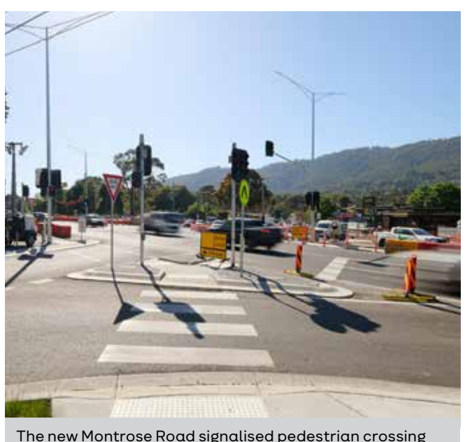
The new Montrose Road signalised pedestrian crossing is now operating

Please continue to support Montrose traders during these works - they're open and keen to welcome you. Learn about some of the ways you can support them on the following pages.