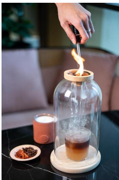
No.84 Cold Brew