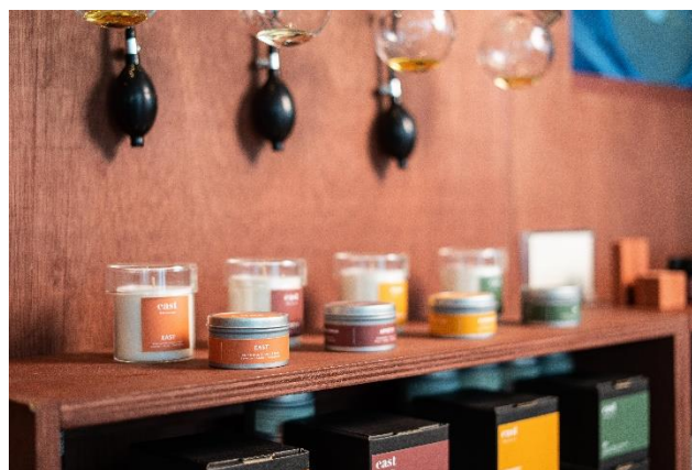
EAST's signature scents