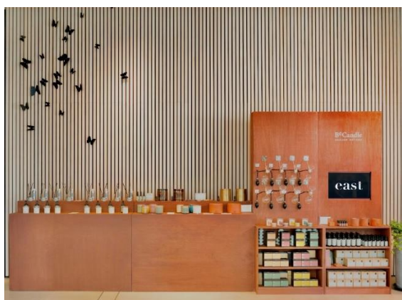
Domain x BeCandle pop-up