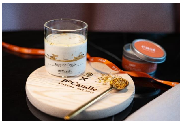
Jasmine Peach Panna Cotta