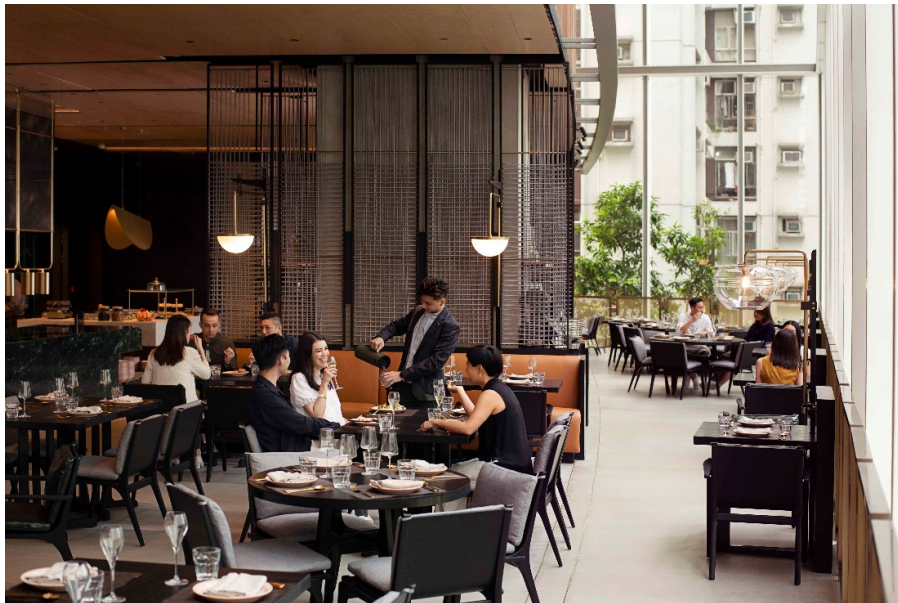
FEAST main dining area

The contemporary lifestyle hotel elevates work, play and stay for modern business travellers, locals and families -- featuring new and improved dining and social spaces