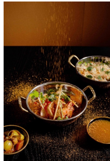
Kadai Prawn from FEAST a la carte menu