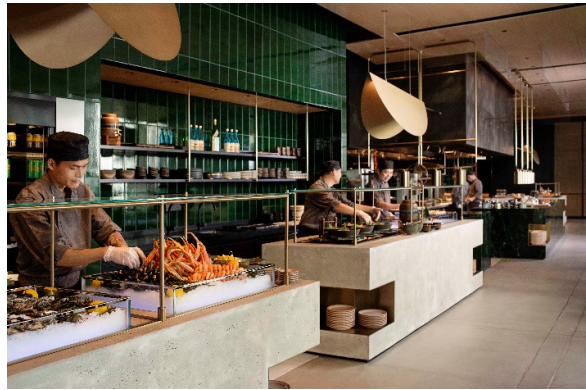
FEAST live kitchen