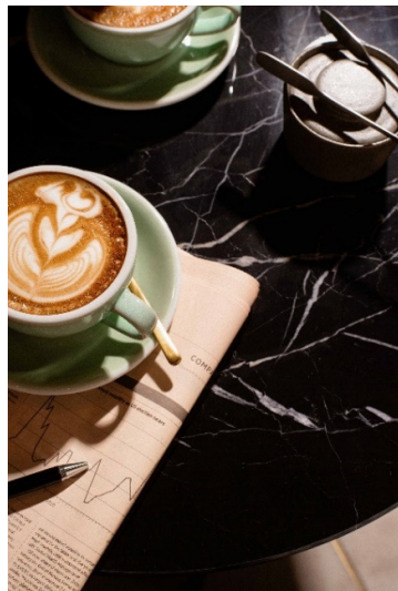
Latte from Domain