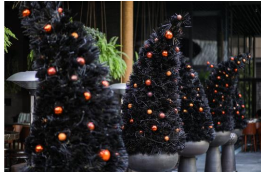
Christmas tree made by up-cycled black plastic straws