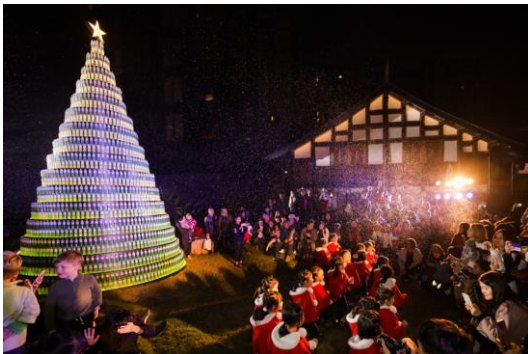
Christmas Tree Lighting Ceremony on 24 th November, 2018