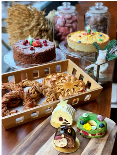
Christmas pasties at The Temple Café's Grab-and-Go counter