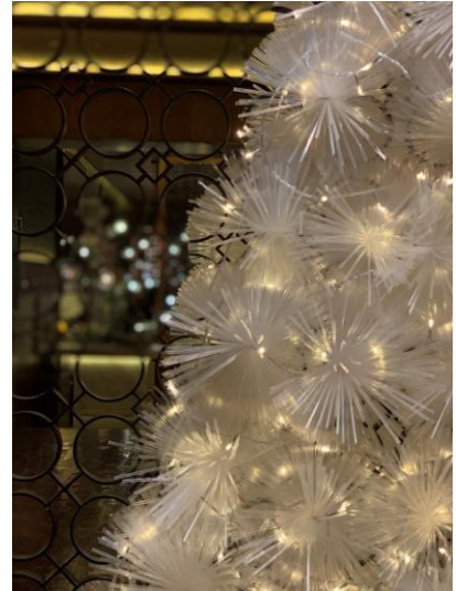
Christmas decorations created by up-cycled plastic straws.