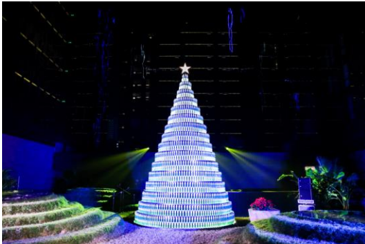
2018 The Temple House Up-cycled Christmas Tree