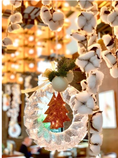
Christmas wreaths created by up-cycled plastic bottles.