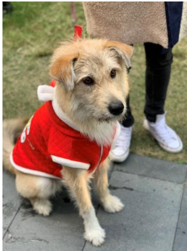
Collaboration with Chengdu Adoption Day