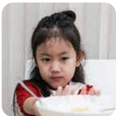
Loss of appetite