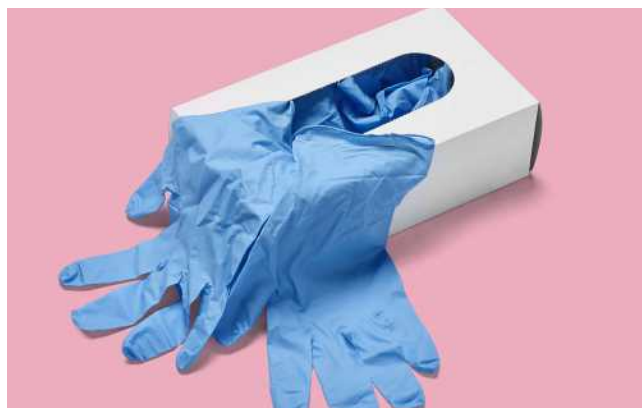
Non sterile gloves