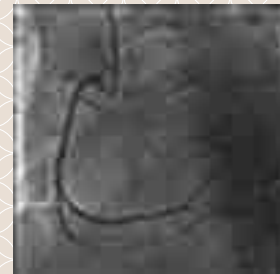
Right coronary artery