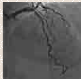
Left coronary artery